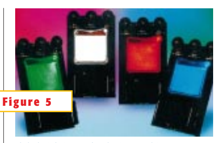
Global Lighting Technologies combines an LED with a molded assembly to function as a backlight for PDA-sized LCD panels.

By placing 50 emitter dice on a thermal substrate and then on a TO-66 package base, the Opto Shark series from Opto Technology gives you wide-angle brightness with built-in thermal management.